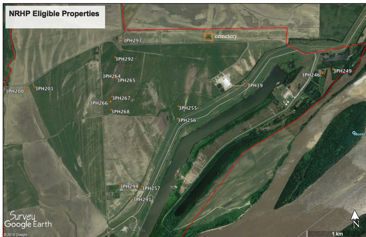
Figure 2. Satellite image of Helena Harbor project area NRHP-eligible sites.