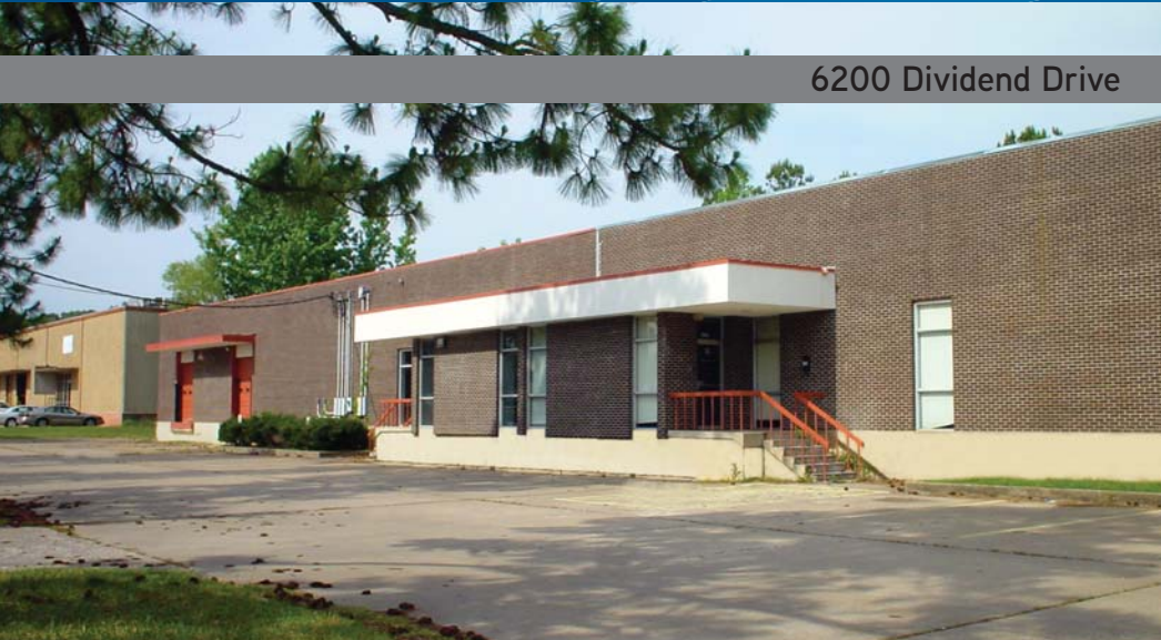
6200 Dividend Drive

6200 & 6210 DIVIDEND DRIVE, LITTLE ROCK, ARKANSAS 72209