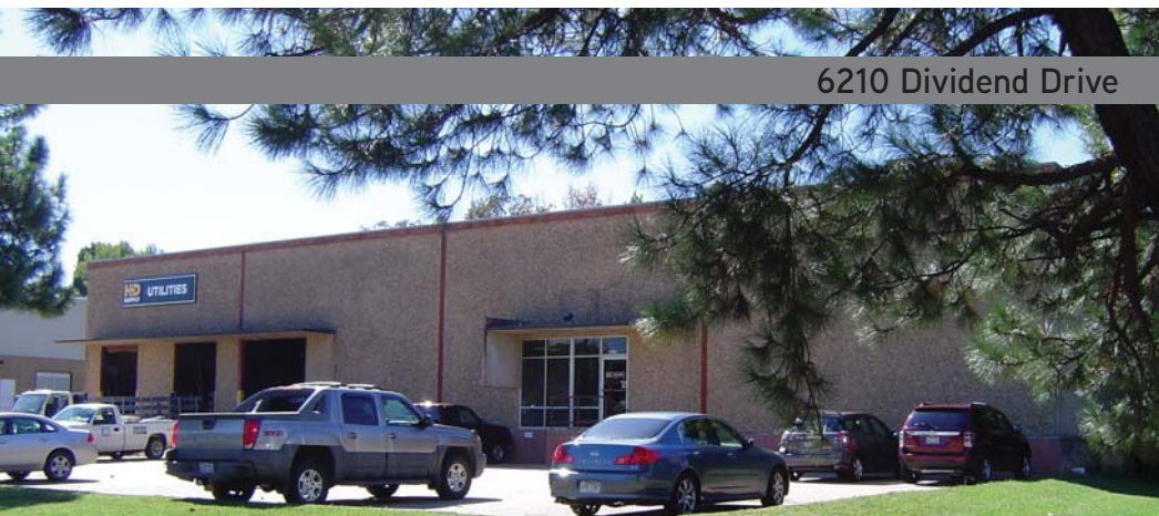
6210 Dividend Drive