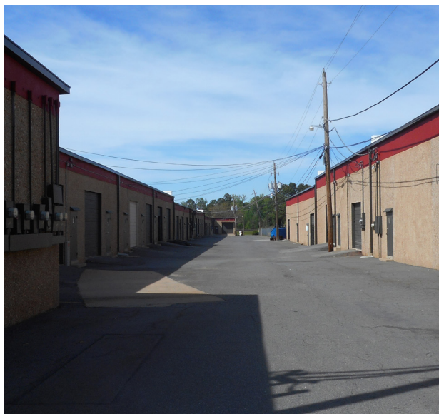
Back of Building 2 & 3